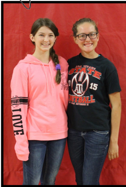
By: High School Journalism Class